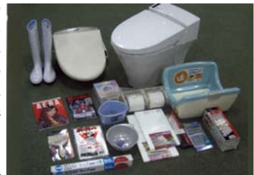
This logo is applied only for SIAA menbers' approved products

On October 9th, 2007, ISO 22196 was published for ISO 22169 for Japanese antibacterial Technology, and "KOHKIN" officially got an approval to diffuse its technology in the world.